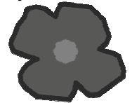
Lest We Forget.