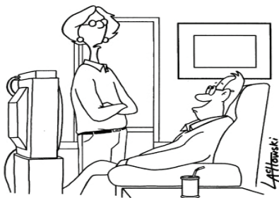
"You realize if you go to Heaven, my relatives will all be there."

Reprinted from Funny Times / PO Box 18530 / Cleveland Hts. OH 44118 phone: 216.371.8600 / email: ft@funnytimes.com